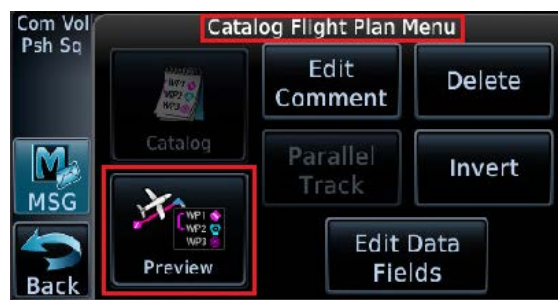
Figure 1: Catalog Flight Plan Menu

Do not use the Preview key on the Catalog Flight Plan Menu.